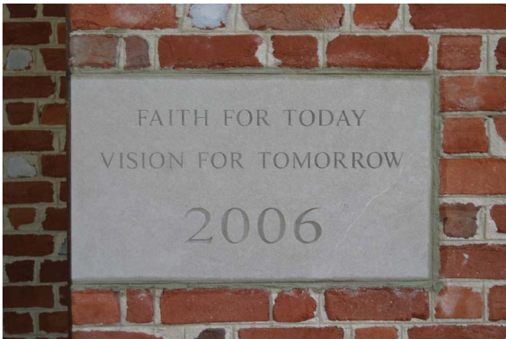
The Cornerstone in Place.