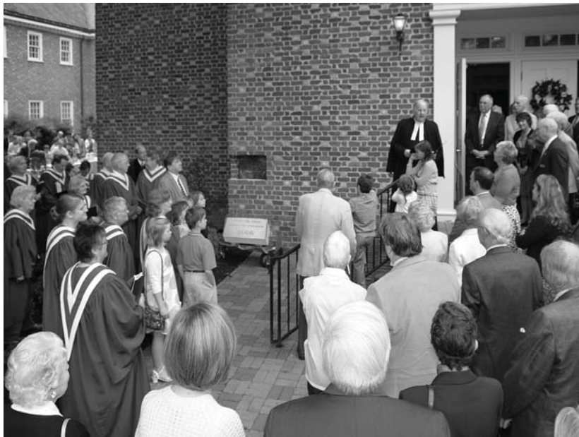
WPC Cornerstone Dedication held Sunday, April 25.